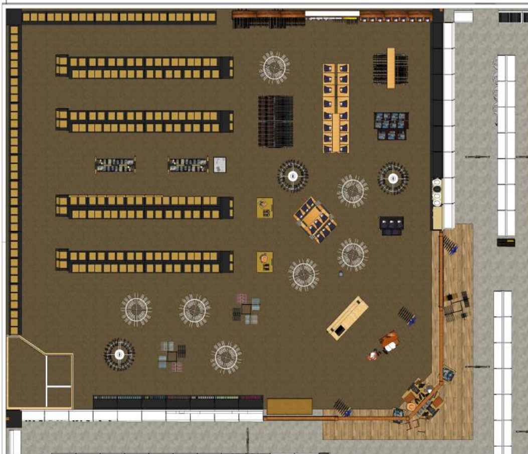
MOHAWK—STATEMENT STONE "CANYON CLAY" SHOWN IN PLAN