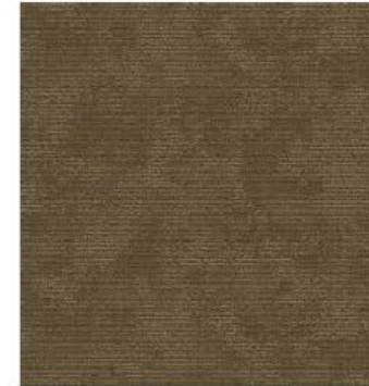
MOHAWK CARPET STATEMENT STONE "CANYON CLAY" 24 X 24 CARPET TILE

PRICING: $2.25 S.F. (APPROX.) + FREIGHT & ADHESIVE ($0.040-$0.50 S.F.)